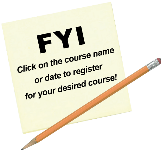
TABLE OF CONTENTS FALL TRAINING CATALOG 2024